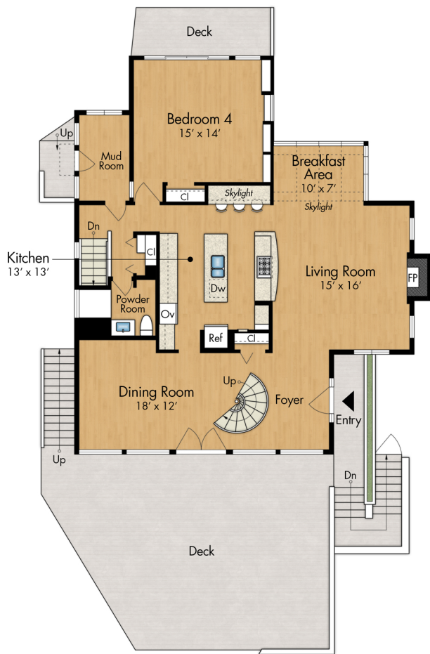
Main Level 1,380 SQ FT