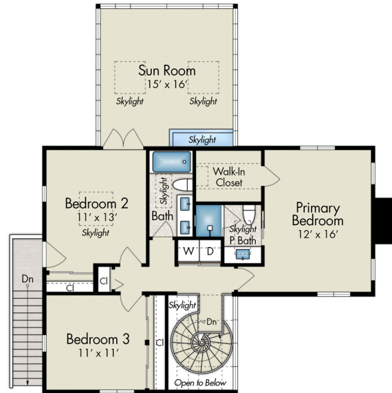
Lower Level 1,128 SQ FT